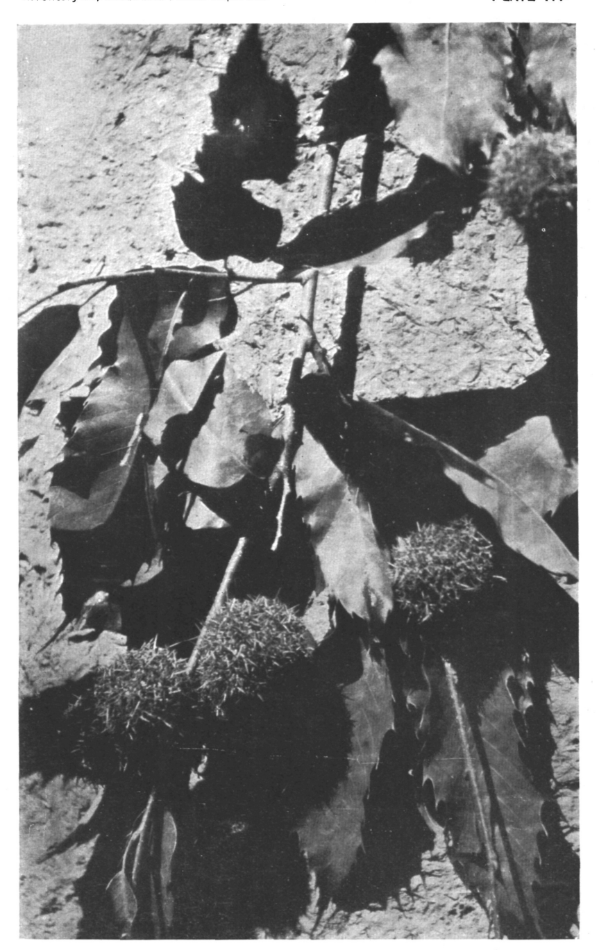
FRUITING BRANCH OF A NEW DISEASE-RESISTANT CHINQUAPIN FROM CHINA. (CASTANEA SEGUINII DODE, S. P. I. No. 45949.)

Th ree important facts have been established in regard to the chestnut bark disease: First, that all species of Castanea are not equally susceptible to the fungus; second, that hybrids between the different species are fertile: and, third, that the factor which produces immunity, whatever that is, appears to be heritable and by breeding and selection can be incorporated with other characters such as size and quality of the nut, size of the tree, etc. This Chinese chinquapin, occurring near Ichang, is a shrubby species, occasionally growing to 40 feet in height. Frank N. Meyer, who discovered the chestnut bark fungus, Endothia parasitica, in China, reports this species as apparently totally resistant to the disease. It grows well on barren mountain slopes but appears to be more moisture loving than the chestnut, Castanea mollissima. Introduced primarily for breeding purposes. (Photographed by Frank N. Meyer, Tzewuhsien, Shensi, China, September 1, 1914; P12248FS.)