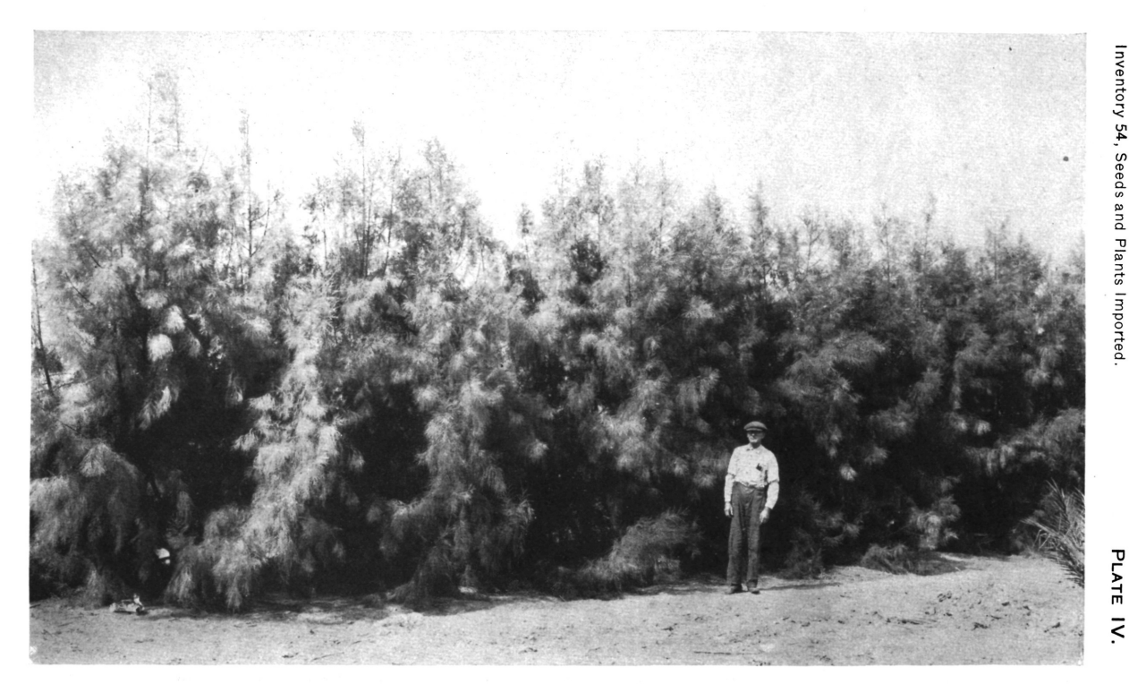
A WINDBREAK OF ATHEL PROTECTING A DATE GARDEN AT INDIO, CALIF. (TAMARIX APHYLLA (L.) KARST., S. P. I. No. 45952.)