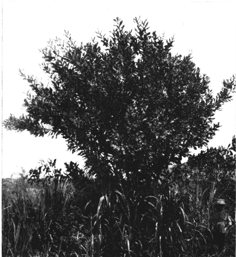
THE QUEENSLAND NUT ( MACADAMIA TERNIFOLIA MUELLER), AS GROWN IN CUBA. (SEE S. P. I. No. 39144.)