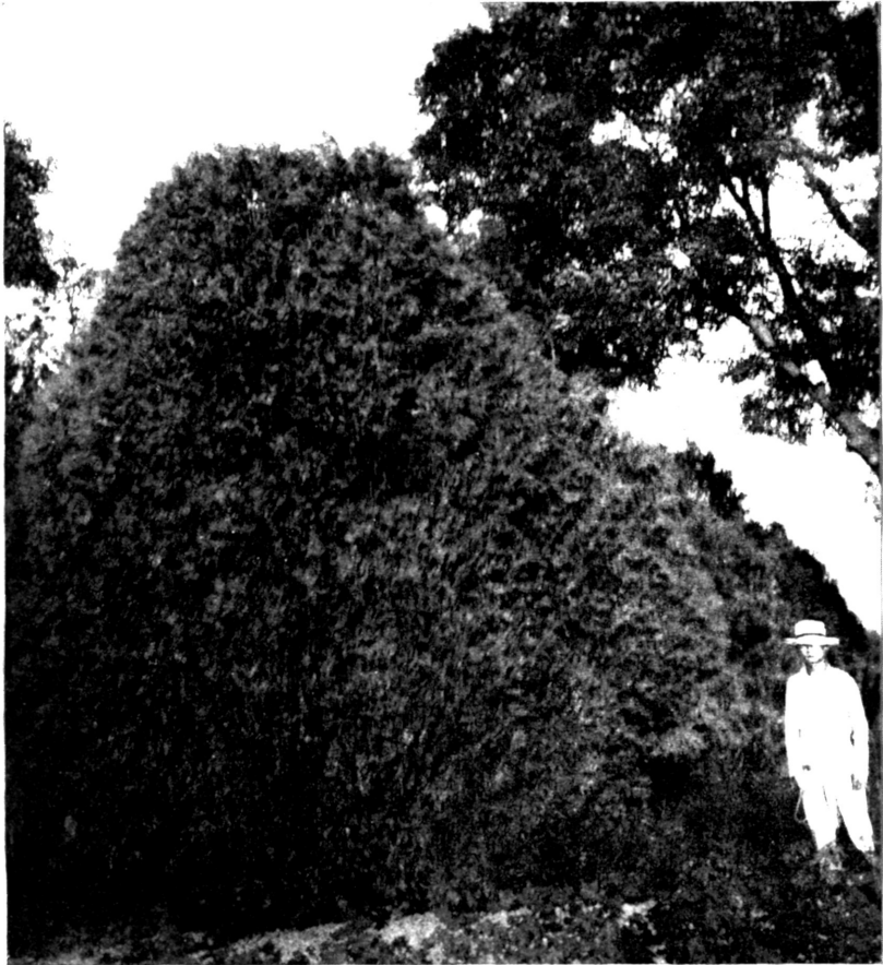
ARBOR VITÆ (THUJA ORIENTALIS L.) IN SHENSI, CHINA. (SEE S. P. I. NO. 38798.)