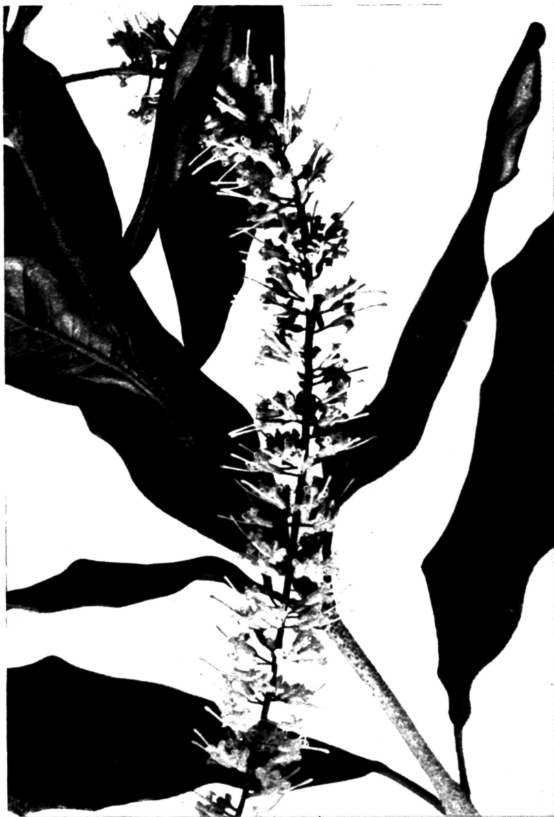
FOLIAGE AND FLOWERS OF THE QUEENSLAND NUT ( MACADAMIA TERNIFOLIA MUELLER), AS GROWN IN FLORIDA. (SEE S. P. I. NO. 39144.)

The leaves are evergreen and of a thick, tough character, giving the tree an attractive appearance.