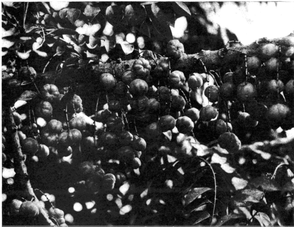
FRUIT AND FOLIAGE OF PHYLLANTHUS ACIDA (L.) SKEELS, AS GROWN IN FLORIDA. (SEE S. P. I. No. 39261.)

A close view of the fruit on the tree shown in Plate IX. The fruit is pale green, round, ribbed, and very acid, with a single hard seed in the center. When cooked with sugar this fruit is said to make an excellent preserve. Its prodigious bearing capacity would seem to entitle it to more serious attention than it appears to have been given in Florida. This fruit is also known as Phyllanthus distichus and Cicca disticha . (Photographed by Wilson Popenoe, Miami, Fla., June 23, 1915; P16367FS.)