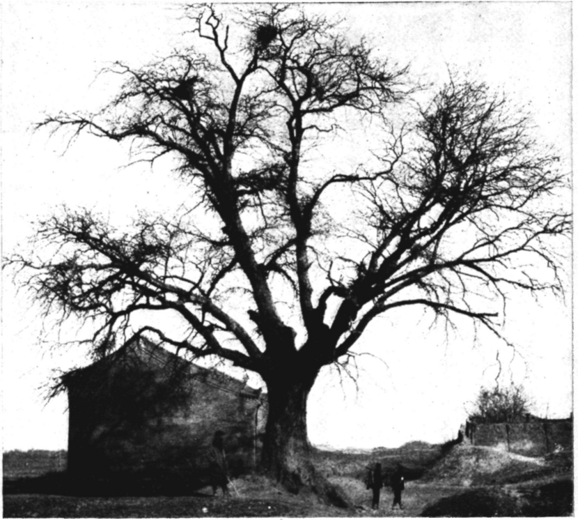
AN OLD SOAP-BEAN TREE ( GLEDITSIA SINENSIS LAM.) NEAR TIENTANGYI, SHENSI, CHINA. (SEE S. P. I. No. 38800.)

A large old tree found in a dry place. The dense head of branches is characteristic of this species of honey locust as seen on the Sianfu plain. It is a long-lived beautiful shade tree with long stout spines and well-rounded head of dense branches and foliage. It is remarkably resistant to drought and a valuable ornamental park and shade tree for the semiarid sections of the United States. The large thick pods, which contain considerable quantities of saponin, are sliced and used as a substitute for soap. No. 38800 is a large-podded variety of this interesting tree. (Photographed by Frank N. Meyer, January 23, 1915; P12160FS.)