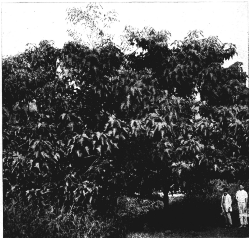
THE LUMBANG ( ALEURITES MOLUCCANA (L.) WILLD.) GROWING IN BAHIA, BRAZIL. (SEE S. P. I. No. 38945.)