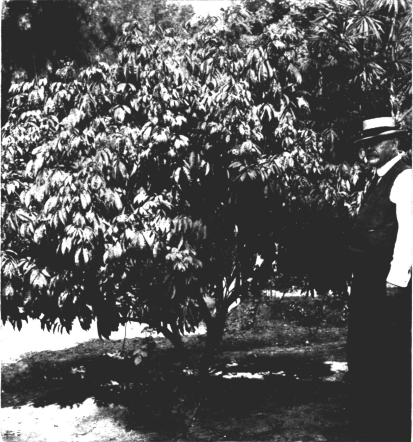
THE FIRST CHINESE LITCHI TREE ( LITCHI CHINENSIS SONNERAT) TO FRUIT IN THE UNITED STATES. (SEE S. P. I. NO. 38779.)