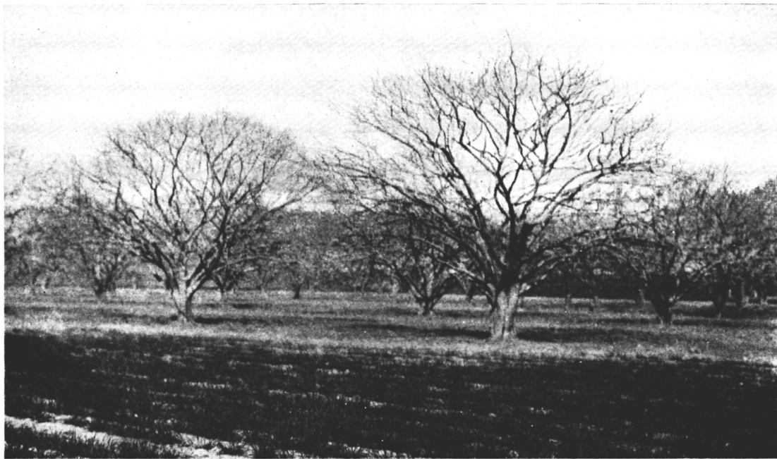
AN ORCHARD OF THE LARGE-FRUITED CHINESE HAWTHORN ( CRATAEGUS PINNATIFIDA BUNGE) NEAR TAIANFU, SHANTUNG, CHINA. (SEE S. P. I. No. 38796.)