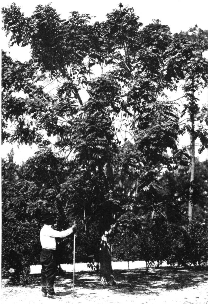
SPATHODEA CAMPANULATA BEAUV., A STRIKINGLY HANDSOME ORNAMENTAL TREE FOR FLORIDA. (SEE S. P. I. No. 39222.)