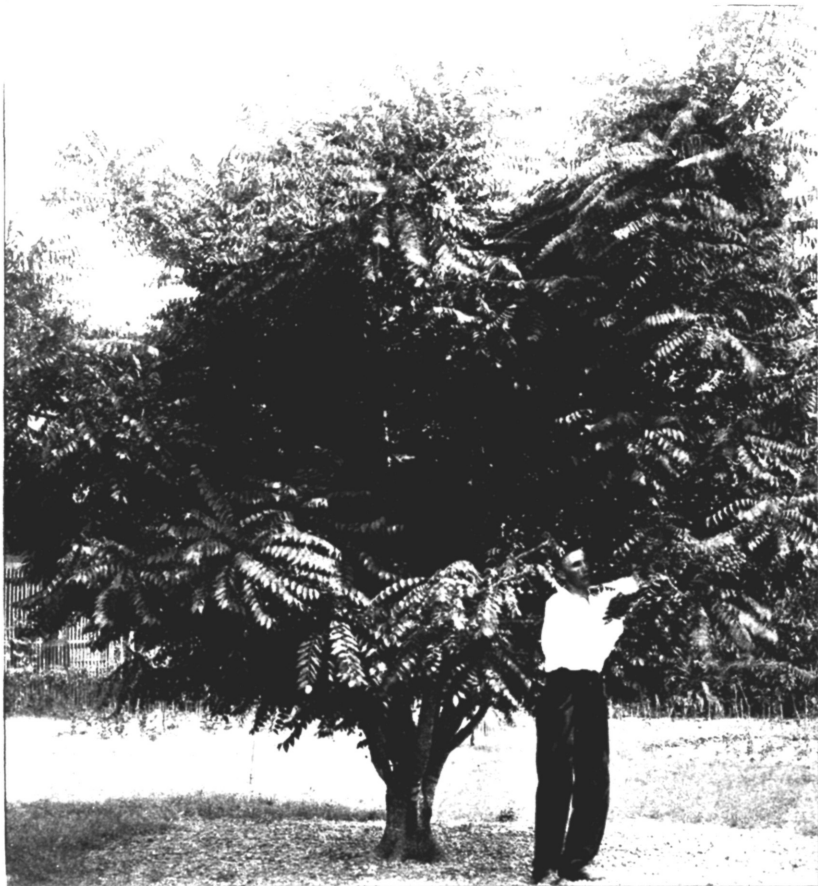
TREE OF PHYLLANTHUS ACIDA (L.) SKEELS, GROWING IN FLORIDA. (SEE S. P. I. NO. 39261.)