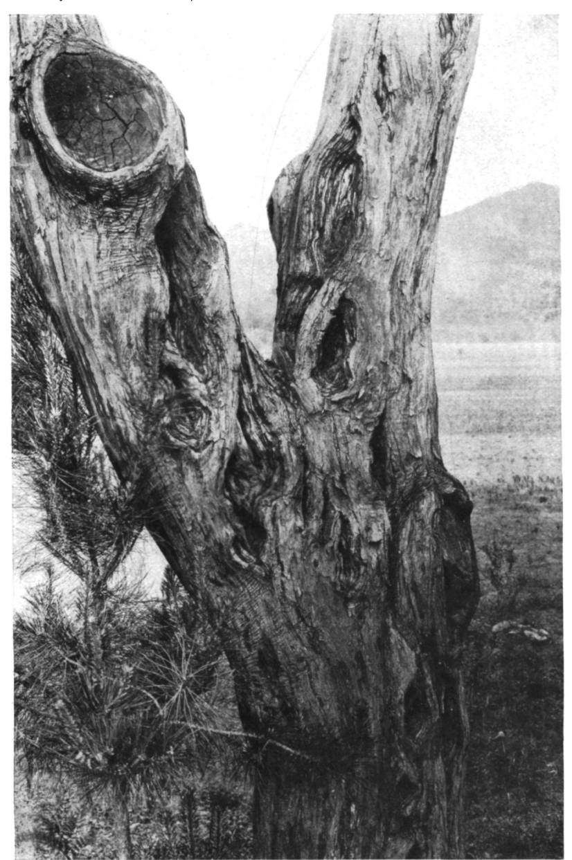
THE TRUNK OF AN OLD CHINESE CHESTNUT TREE (CASTANEA MOLLISSIMA) NEAR SAN TUN YING, CHINA. (S. P. I. NO. 35891.)