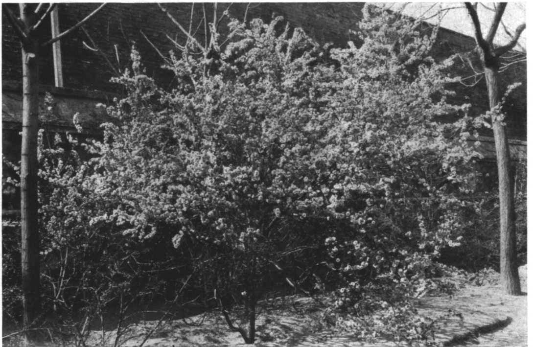
AN ELM-LEAVED FLOWERING PLUM (PRUNUS TRILOBA) AT PEKING, CHINA. (S. P. I. No. 36112.)