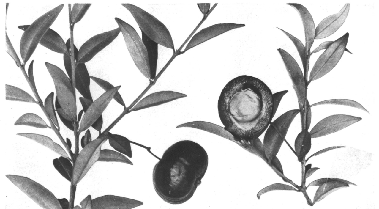
A New Paraguayan Fruit (Eugenia Sp.) at Altadena, Cal. (S. P. I. No. 36167.)