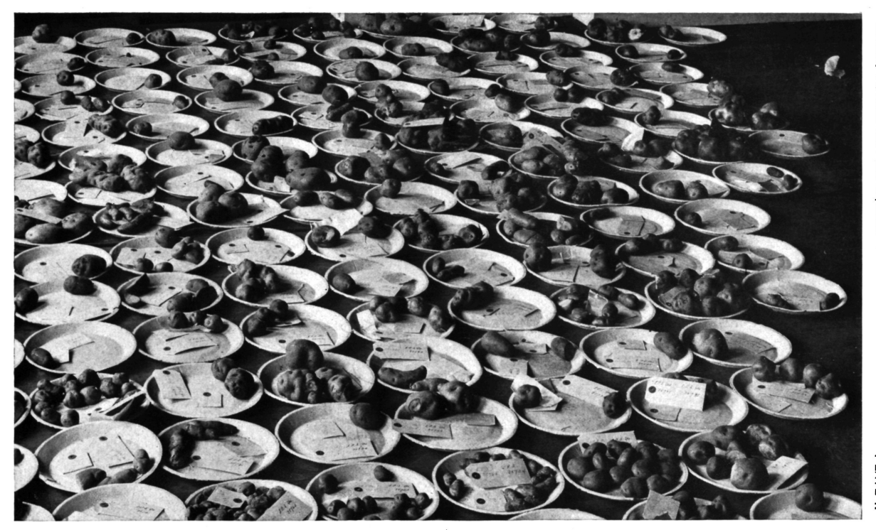
A COLLECTION OF WILD AND CULTIVATED POTATO AND MELLUCO TUBERS FROM SOUTH AMERICA. (S. P. I. Nos. 35703 to 35868.)