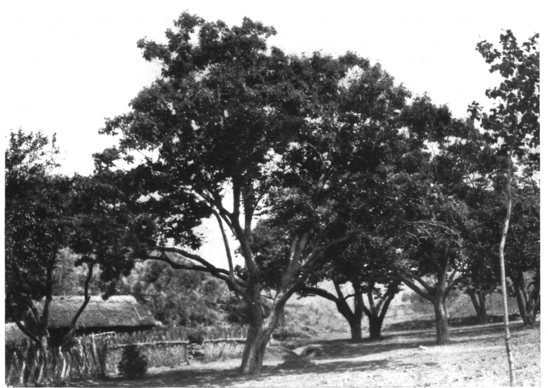
A GROVE OF CHINESE CHESTNUT TREES (CASTANEA MOLLISSIMA) AT SAN TUN YING, CHINA. (S. P. I. No. 35891.)