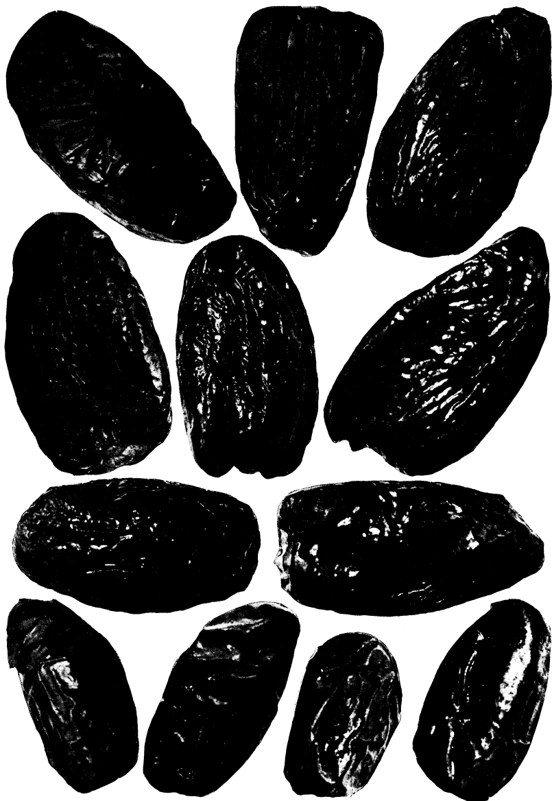
THE MEDJHOOL DATE, FROM THE TAFILELT REGION, MOROCCO. NATURAL SIZE. (S. P. I. No. 18630.)

This is a dark-colored variety of very unusual size and good flavor. It is exported to Spain and England, but is unknown in American markets. S. P. I. No. 34213 consists of four offshoots of this variety presented by the Service Botanique of the Algerian Government, especially secured by Dr. L. Trabut, director of that service and collaborator of the Office of Foreign Seed and Plant Introduction. (Office photograph No. 1826, May 28, 1906.)