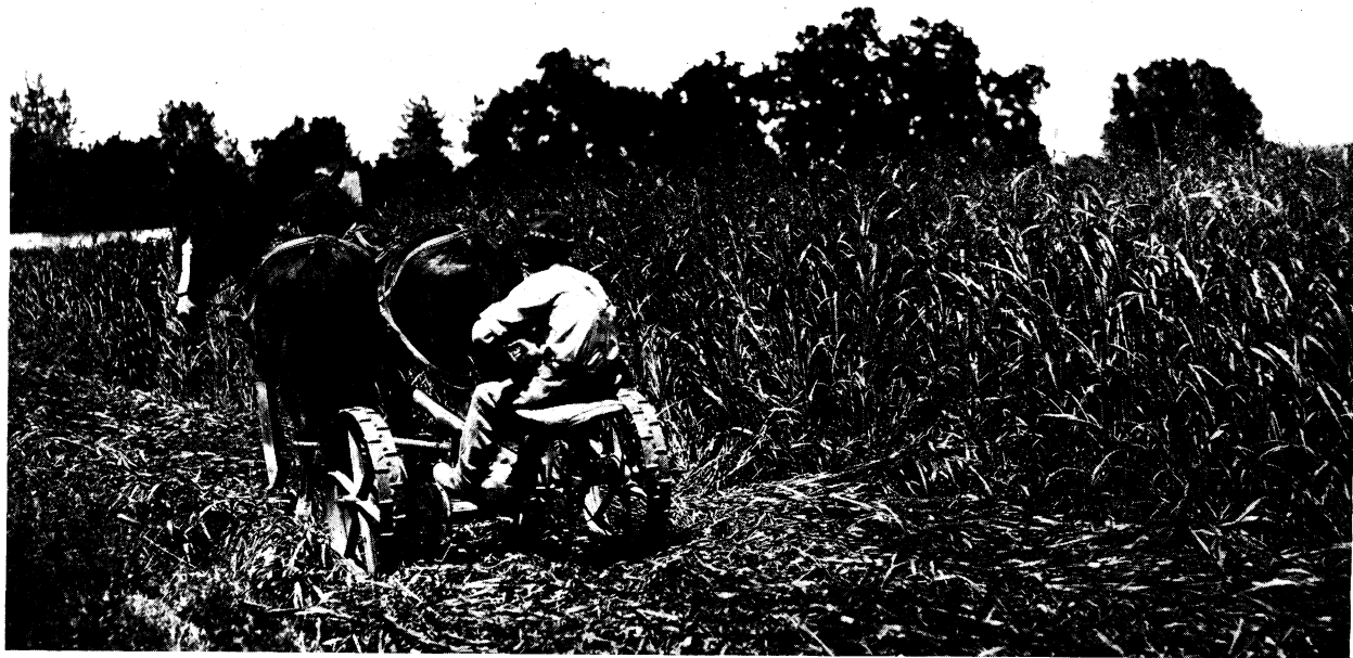
SUDAN GRASS (HOLCUS SORGHUM) AT THE CHICO FIELD STATION. (S. P. I. No. 34114.)

Apparently the wild or half-domesticated form of our cultivated sorghums, crossing readily with them and entirely lacking the undesirable rootstocks of the ordinary Johnson grass, to which it is related. It promises to be a valuable fodder grass in California, Texas, and the Gulf States. Nine-tenths of an acre at Brownsville, Tex., planted March 5, mowed May 14, yielded hay weighing 7,080 pounds.