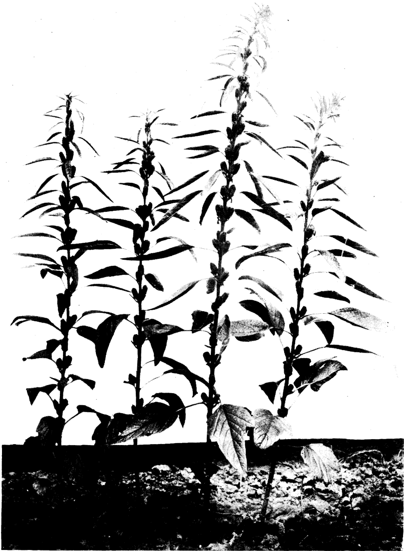
PLANTS OF SESAME ( SESAMUM ORIENTALE L.) 3 TO 4 FEET TALL, AT THE YARROW FIELD STATION, ROCKVILLE, MD. (S. P. I. No. 26438.)

An important oil seed, much cultivated in China, India, Palestine, and to some extent in Mexico. Selection work will be necessary to do away with the shattering of the seed as soon as it is ripe. The oil is important for table use, and the seeds are much used in confectionery in oriental countries. See S. P. I. No. 34290. (Photographed by Dorsett, No. 8175, July 23, 1911.)